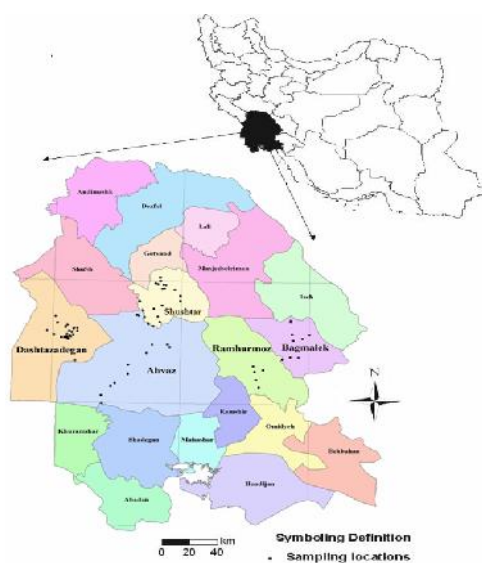
Figure 1. Distribution of sampling locations

The research focused on the paddy fields of Khuzestan province, Southwest Iran (Fig. 1). The study region consists of five sub regions including Dashtazadegan, Ahvaz, Shushtar, Ramhormoz, and Baghmalek. In total 70 paddy farms was randomly selected in study region and soil and rice seed samples were taken from each farm.